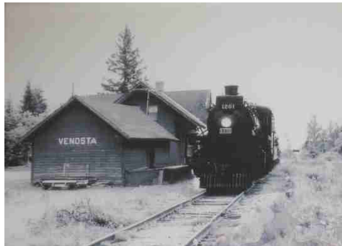
Photo credit: Venosta station, circa 1930. Courtesy of James Irwin

For more than 80 years, from the 1880s to the 1960s, the railway to Maniwaki was critical to the Gatineau Valley's economy—from shipping goods and natural resources in and out, to ferrying locals, cottagers and tourists to and from the Valley.