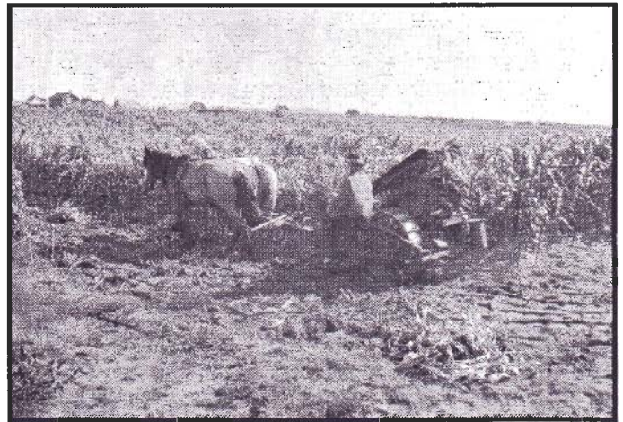
Cutting Corn in Kazabazua (1924)

John Boyd Collection / Library and Archives Canada (R-000133)