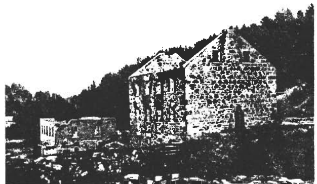
Wakefield Mill after the fire of 1910.